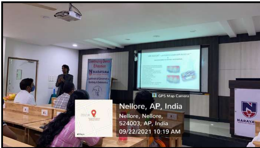
Lecture on composites