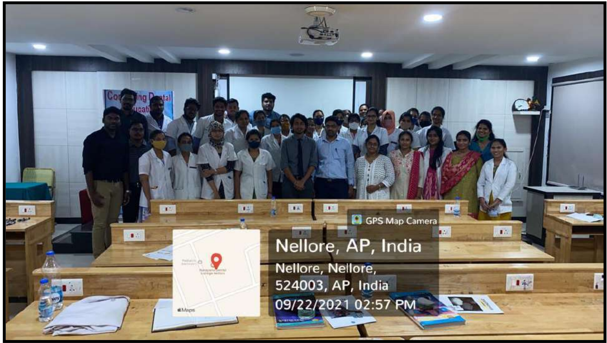
Participants along with the speaker