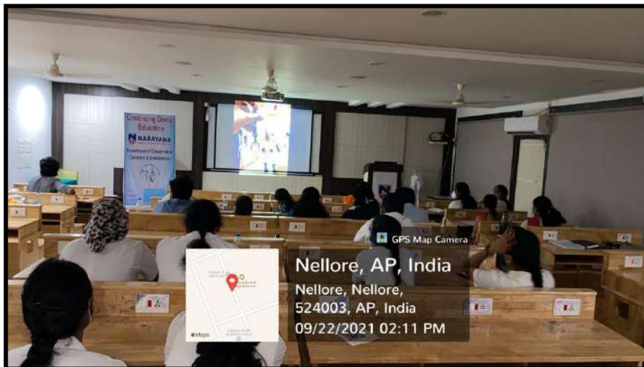
Live demonstration by the speaker